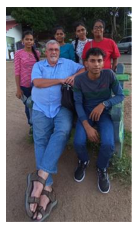
Me and my kids on an outing.